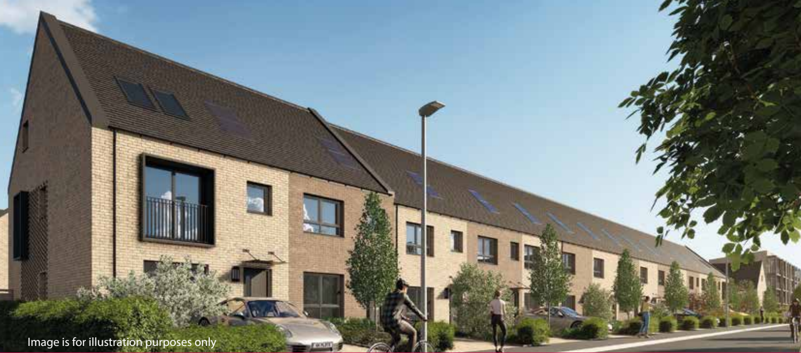
Image is for illustration purposes only