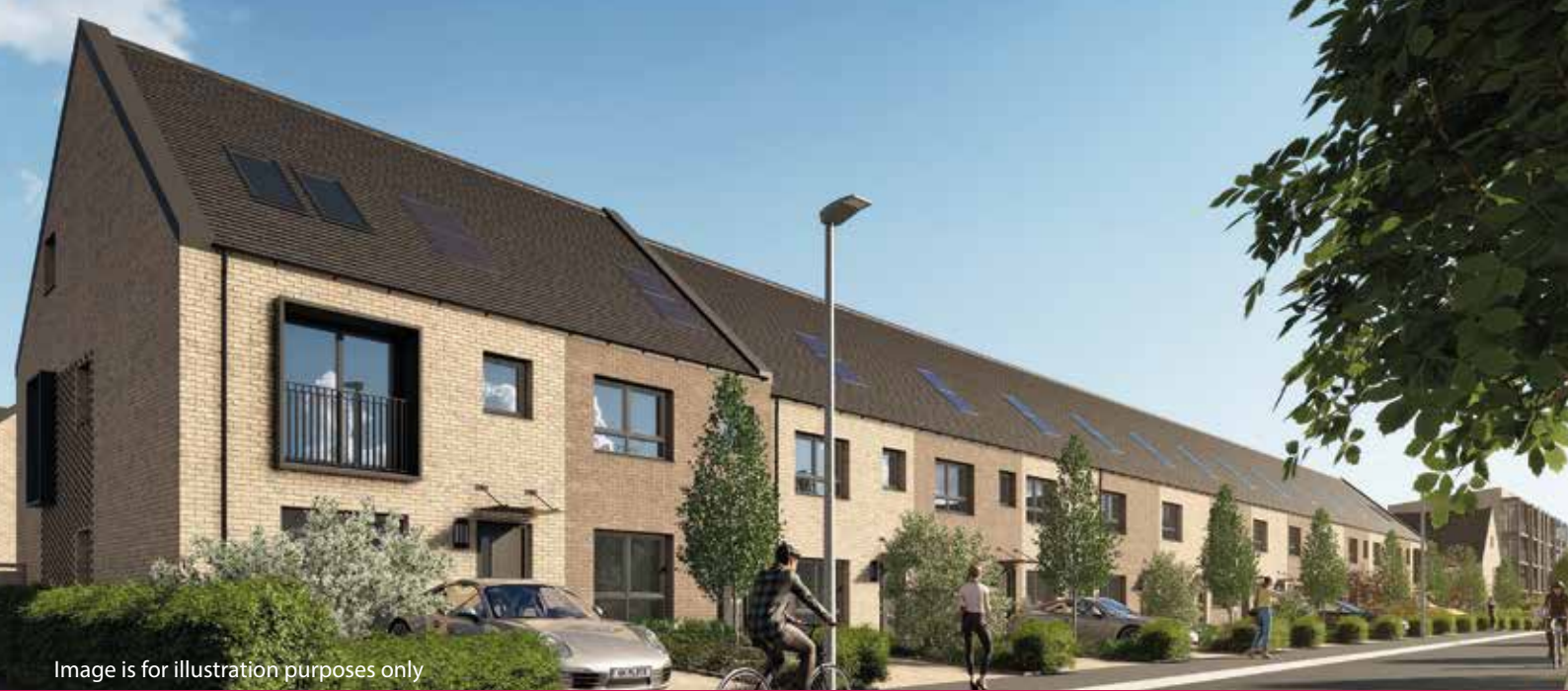
Image is for illustration purposes only